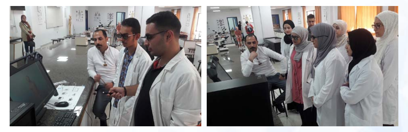
YU sent 3 students to receive training in Malta and Slovakia, September 2019.

In addition, YU Faculty of Medicine within July 2019 hosted a workshop in training their medical students on how to navigate through the Zspace machine (3D Anatomy).